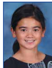
Katherine Leonard Moncure School